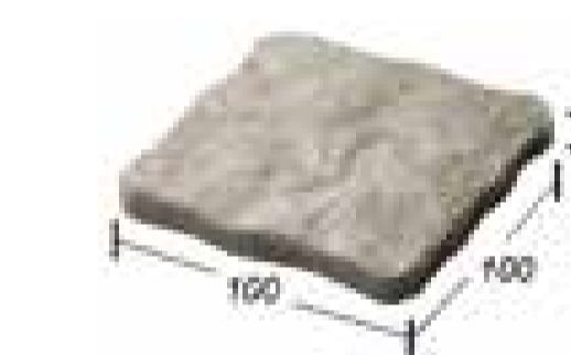
Code: NAP-101 100x100x13 mm. 81 pcs./sq.m. 60 pcs./ctn. 0.75 sq.m./ctn.