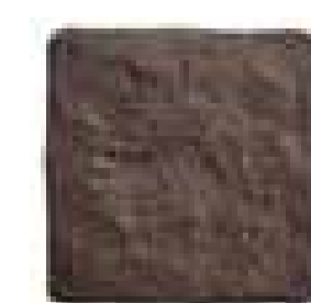
Santa Fe Black