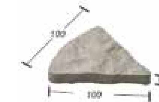
Code: NAP NT-100 100x100x13 mm. 100 pcs./sq.m. 60 pcs./ctn. 0.60 sq.m./ctn.