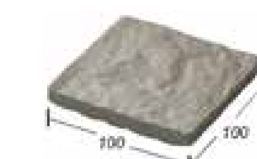
Code: NAP-104 100x100x13 mm.(flat edge) 81 pcs./sq.m. 60 pcs./ctn. 0.75 sq.m./ctn.