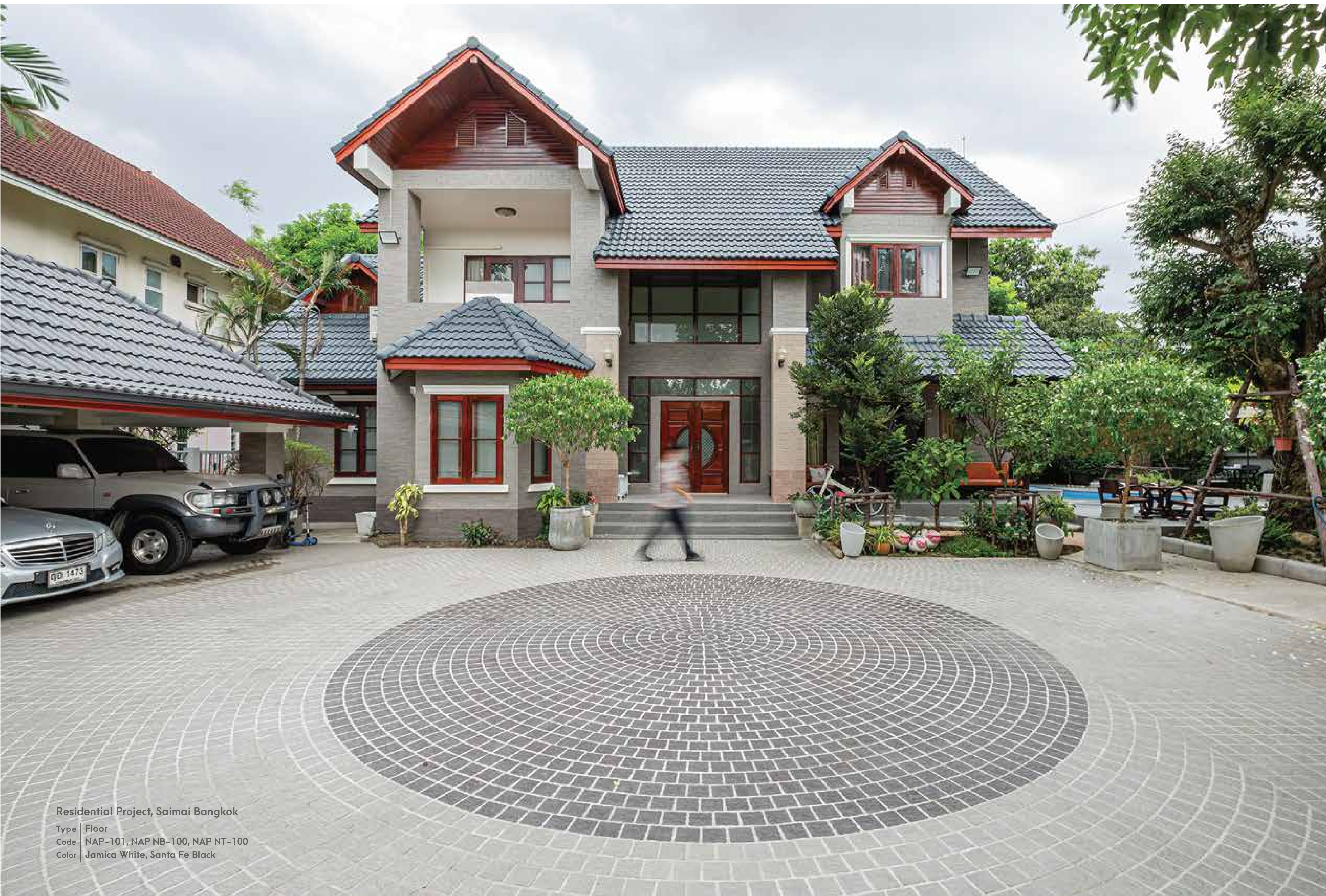
Residential Project, Saimai Bangkok Type Floor Code NAP-101, NAP NB-100, NAP NT-100 Color Jamica White, Santa Fe Black