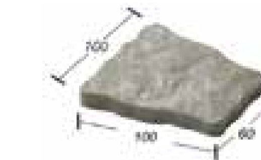
Code: NAP NB-100 60x100x13 mm. 90 pcs./sq.m. 70 pcs./ctn. 0.78 sq.m./ctn.