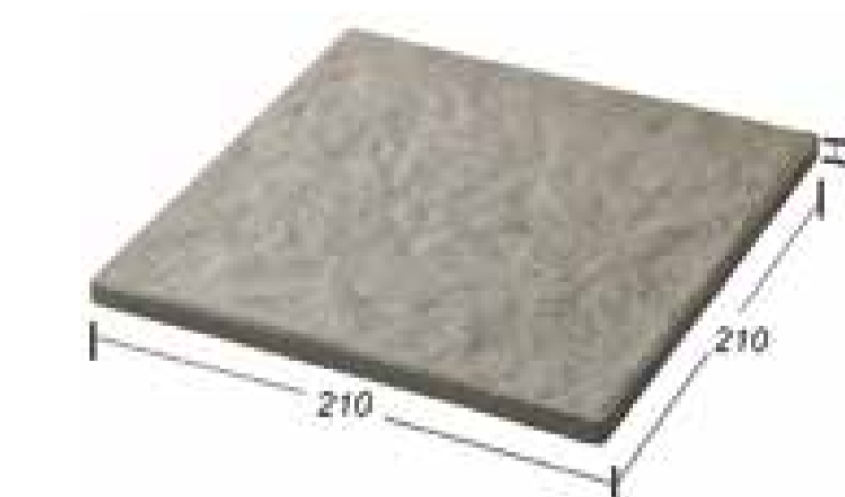
Code: NAP-202 210x210x13 mm. 22 pcs./sq.m. 16 pcs./ctn. 0.76 sq.m./ctn.

* pcs./sq.m. are calculated based on 1 cm. joint